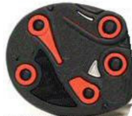
*NEW* Replacement soles for the lightweight Dwarf.

WARNING: These boots must NOT be worn during Sexual Intercourse.