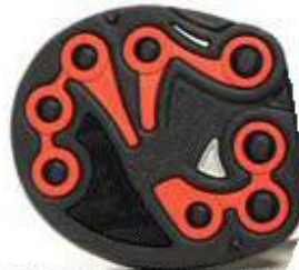
Replacement soles now available!